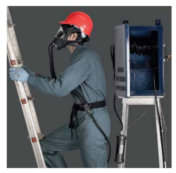
Airline System With FRP Wall Mounted Cabinet

The apparatus consists of a waist belt with an airline belt manifold. This incorporates a MINI-REGULATOR to which the air supply